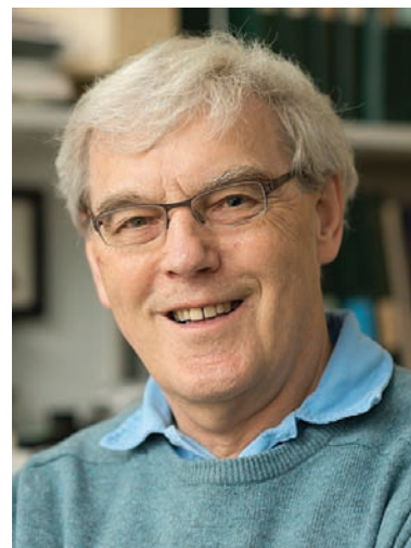
Richard Henderson (Born in 1945, Edinburgh, Scotland) MRC Laboratory of Molecular Biology, Cam- bridge, United Kingdom

The Nobel Prize in Chemistry 2017 was awarded to Jacques Dubochet, Joachim Frank and Richard Henderson “for developing cryo-electron microscopy for the high-resolution structure determination of biomolecules in solution”.