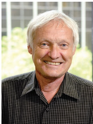
Joachim Frank (Born in 1940, Siegen, Germany) Columbia University, New York, NY, USA